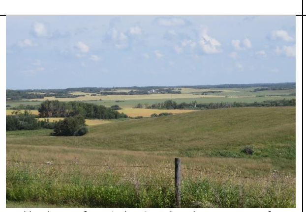
Parkland area of Manitoba, Canada.